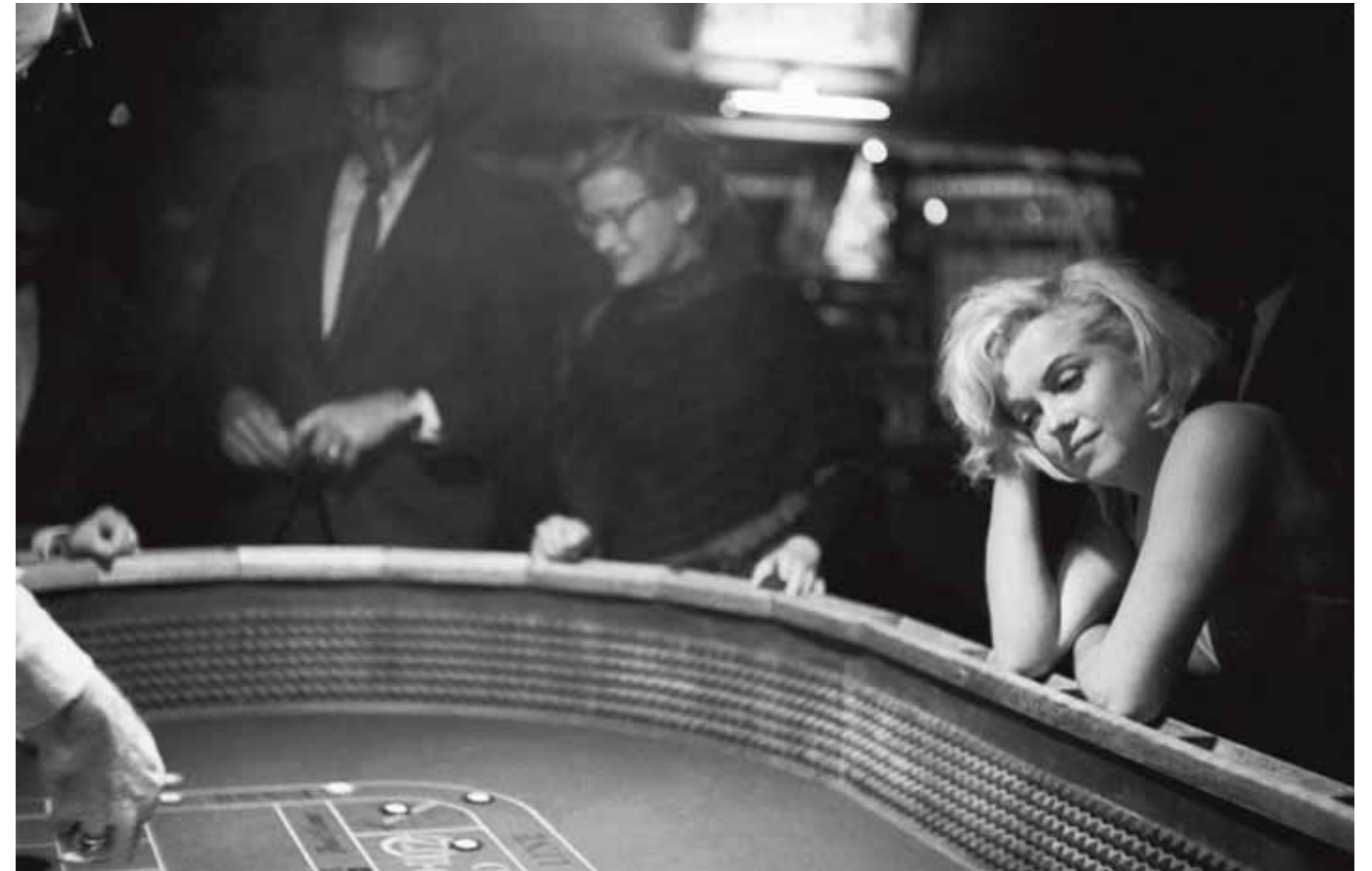
ABOVE: Monroe at the gaming tables. RIGHT: Gable on location in his silver Mercedes Gullwing Coupe.

Gable, Miller, and Huston all agreed that Langland himself was the statement of the picture. He was the common denominator in an era of social change and coming unrest: the holdout realizing the need for personal dignity in a society bent on destroying individuality. In the end Miller could not see where Clark Gable ended and Gay Langland began. "He and Gay Langland are one and the same," he said. "Clark is a hero in the