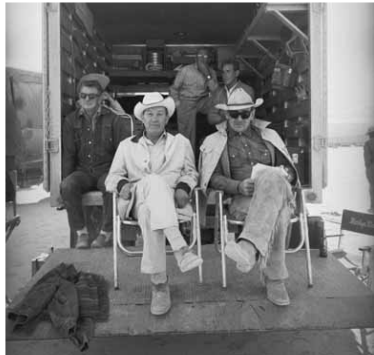
Although it was her last motion picture, The Misfits enabled Marilyn Monroe to prove that she was a great dramatic actress. That achievement was one of writer Arthur Miller's reasons for doing the picture. TOP: Gable, Monroe, and Clift review the climactic horse scene. BOTTOM RIGHT: Gable takes a break with the crew. BOTTOM LEFT: Gable's character Gay Langland to Monroe's Roslyn—"When you smile, it's like the sun coming up,"

Monroe announced her separation from Arthur Miller, her husband of four years. Then the day after filming wrapped, Clark Gable suffered a heart attack, was hospitalized, and died 11 days later, having never seen the completed picture.