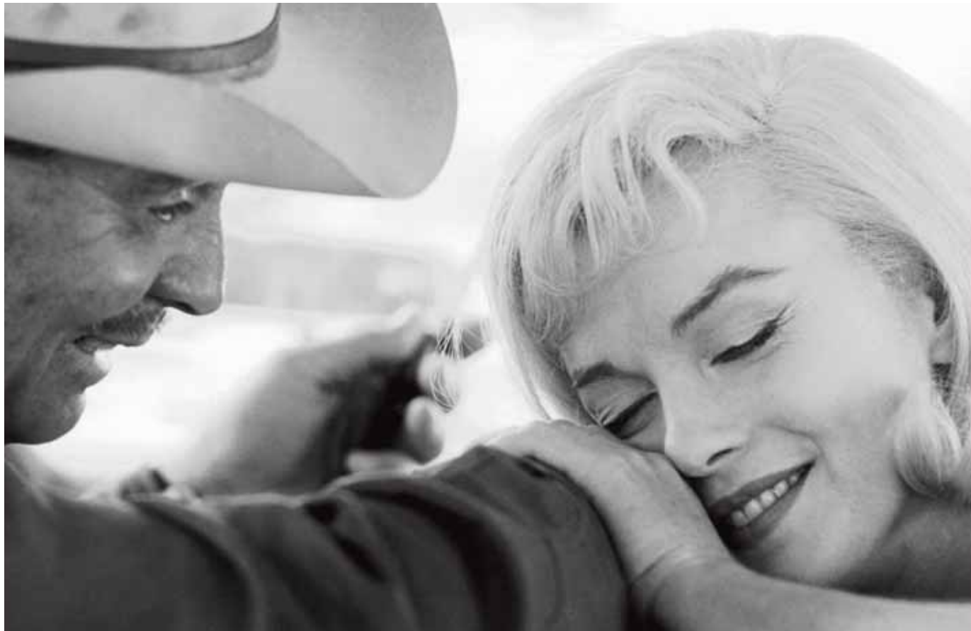
Photographer Henri Cartier-Bresson said of Monroe, "There is something extremely alert and vivid in her, an intelligence. It's her personality, it's a glance, something very tenuous, very vivid that disappears quickly, that appears again."

character Guido quietly questions Gay Langland's intentions while pretending to be a good friend. Montgomery Clift's Perce Howland is the honest cowboy who finds himself in this complicated crowd. He is a simple, resolute character chasing rodeo dreams. Clift's cowboy persona in The Misfits is a long way from the dark and brooding world of his character Matthew Garth opposite John Wayne some 14 years earlier in the Howard Hawks' classic Red River .