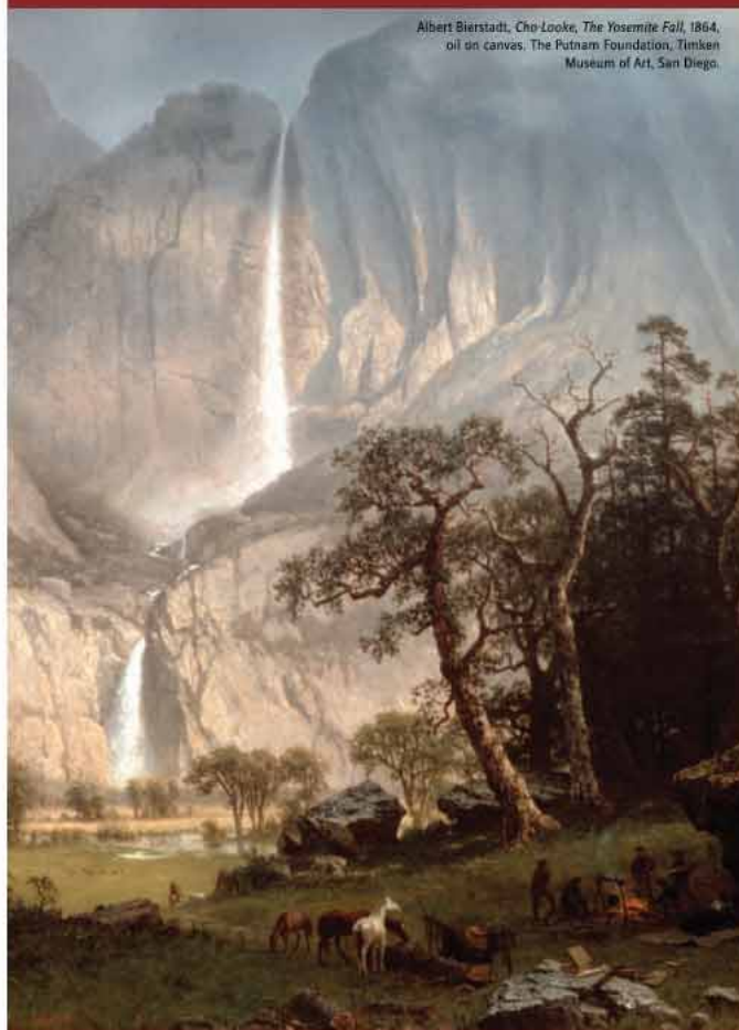
Albert Bierstadt, Cho-Looke, The Yosemite Fall, 1864, oil on canvas. The Putnam Foundation, Timken Museum of Art, San Diego.